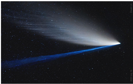
Comet NEOWISE by Zixuan Lin

...that the observation of comet tails led to the first supposition of an outflow from the Sun that we now call the solar wind? Comets have two tails. The charged particles of the solar wind direct the ion tail (blue) away from the Sun. The dust tail responds to outward pressure from sunlight yet curves as heavier dust particles continue moving in solar orbit.